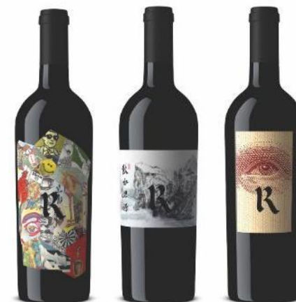
The Absurd, Beckstoffer To Kalon & Dr. Crane Highly allocated