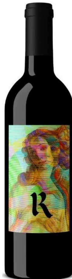
Beckstoffer To Kalon