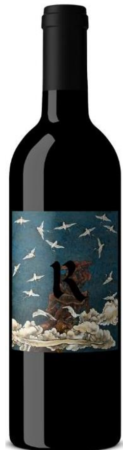
Beckstoffer Dr. Crane