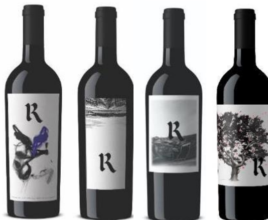
Estate Wines The core of our portfolio