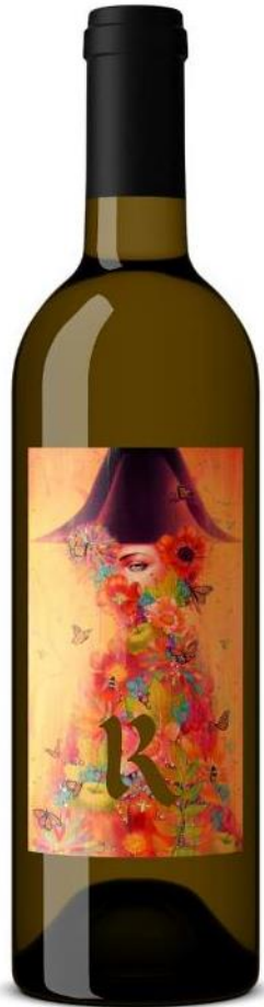
Fidelio (vintage 2022)