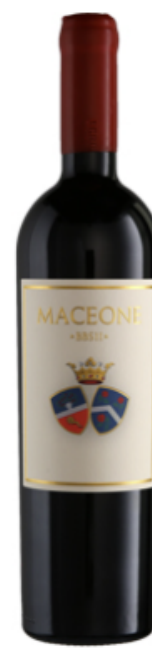
Jacopo Biondi-Santi Castello di Montepò, Maceone, Maremma, Tuscany, Italy 2019