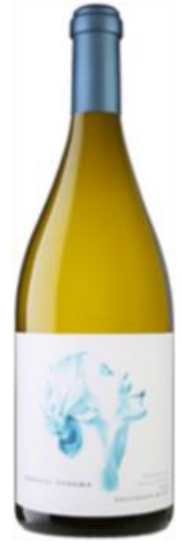
Summer Dreams, Walking on Venice Beach Sauvignon Blanc, Sonoma Coast, Sonoma County, California, USA 2022