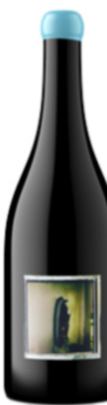
OLG, Our Lady of Guadalupe Vineyard Pinot Noir, Sta Rita Hills, Santa Barbara County, California, USA 2022