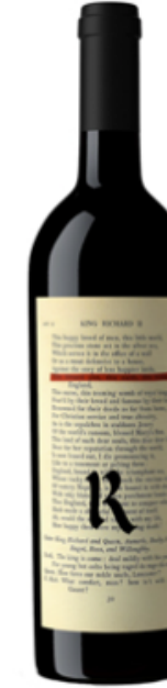
Realm Cellars, The Bard Red Wine, Napa Valley, California, USA 2021