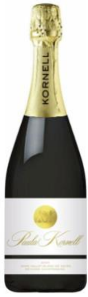
Paula Kornell, Blanc de Noirs, Napa Valley, California, USA 2020