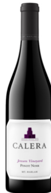
Calera, Jensen Vineyard Pinot Noir, Mount Harlan, San Benito County, California, USA 2021