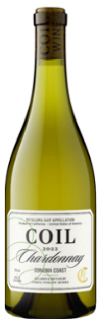
Coil, Chardonnay, Petaluma Gap, Sonoma County, California, USA 2022