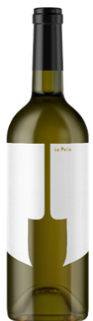
La Pelle, Sauvignon Blanc, Napa Valley, California, 2021