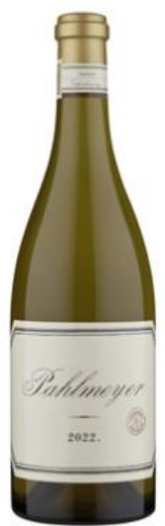
Pahlmeyer, Chardonnay, Napa Valley, California, USA, 2022