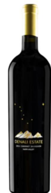
Denali Estate, Cabernet Sauvignon, Napa Valley, California, USA 2016